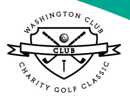
June 14 & 15, 2023